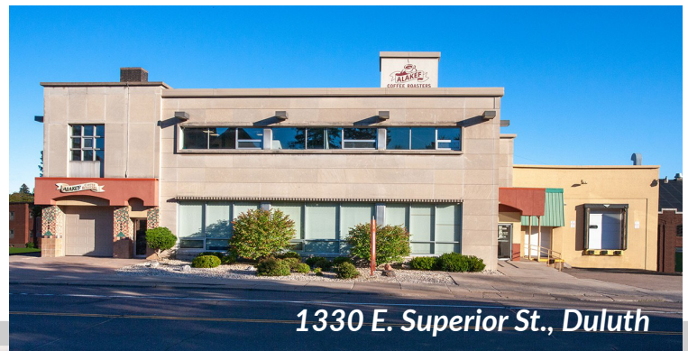
1330 E. Superior St., Duluth